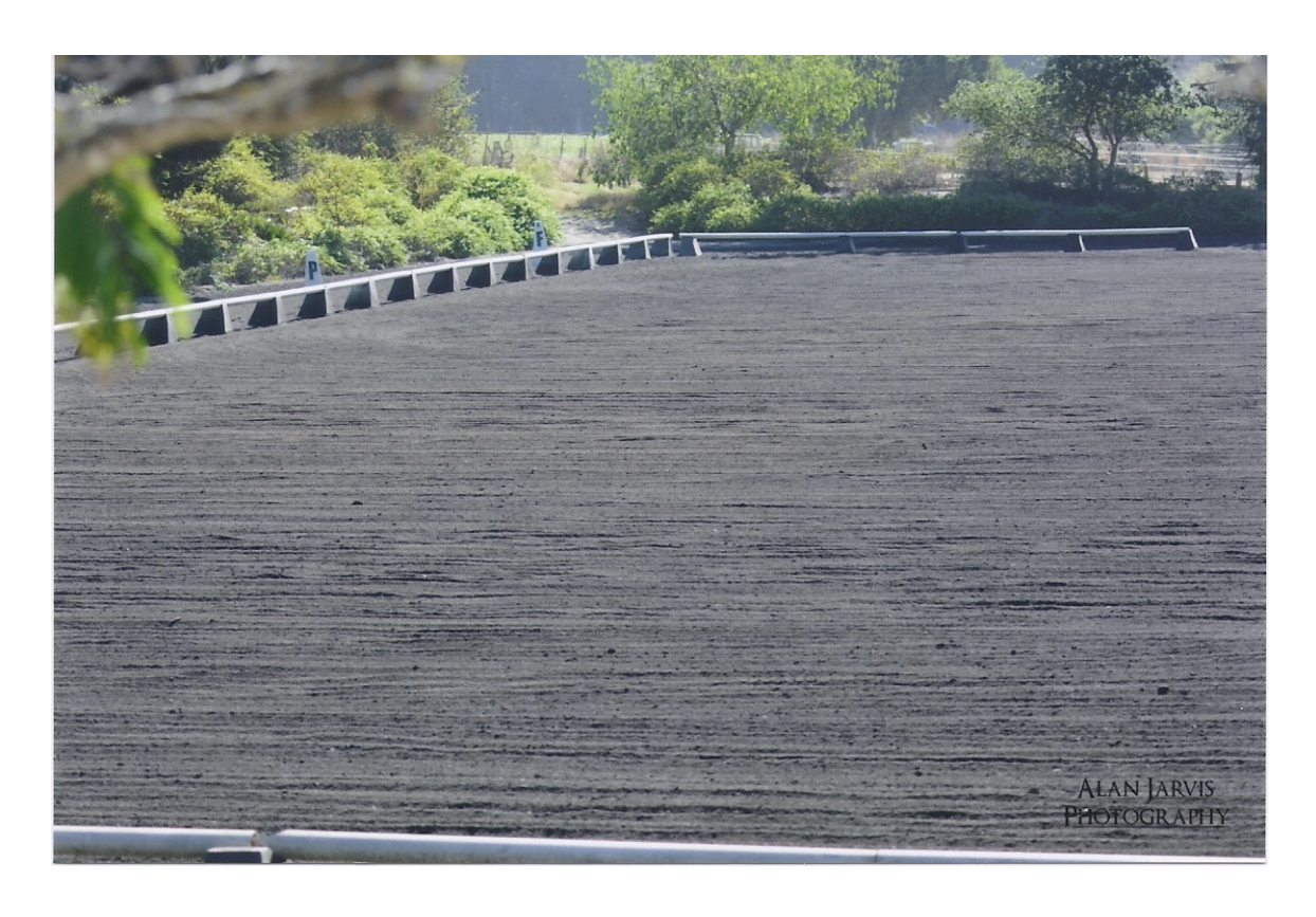
The upper show arena