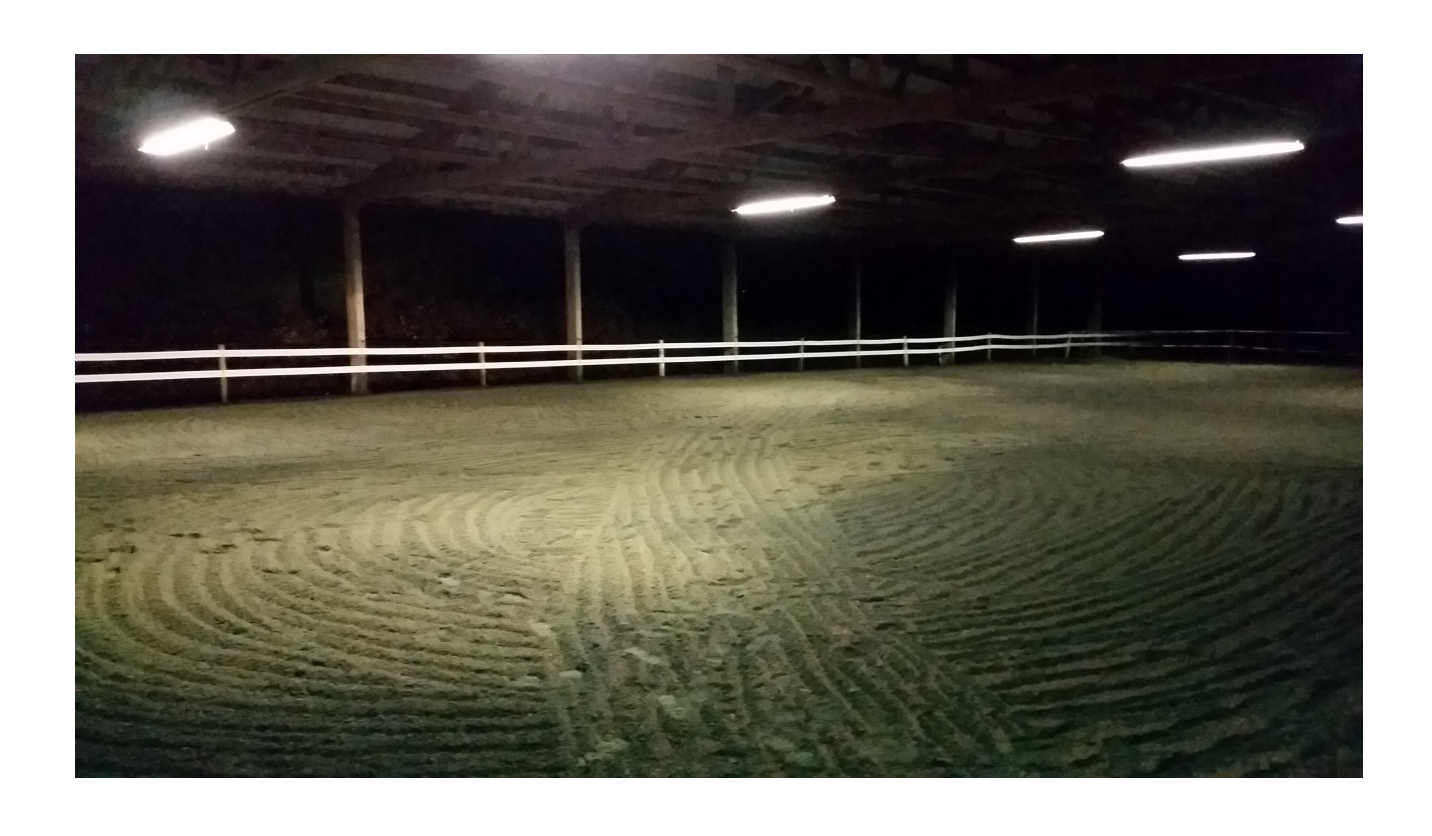
The covered Warm Up arena